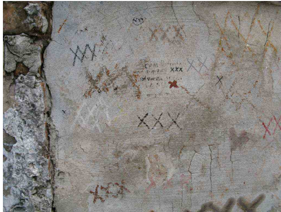
Fig. 1. Three x's on an unmarked tomb open up a gateway to the underworld. St. Louis Cemetery No. 1, Rampart Street, New Orleans, Louisiana.

Purloined Letter', for example, the templum set by the exchange of the reward for letter rescued by the detective Dupin becomes the mathematical median determining how phrases from either half will be aligned. 6 This secular application of a sacred technique reveals, in its aim to create an effective experience, the dead may be brought to life by virtue of a geometric arrangement. Voudoun tradition formalizes this through its tradition of 'cosmograms', geometric fields established by objects, plant materials, etc. buried within the walls and floors of houses to assist the magic practitioner's temporalized curses and blessings. The centrality of quadration is evident in the abbreviation of this practice into the commonly use of three X's to create a gateway to the realm of the dead, a common graffiti scratched on tombs in the public cemeteries of New Orleans and elsewhere.